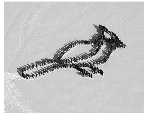
Cardinal on the lake.

The People's Art Project is a celebration of the people, animals and environment of the Iowa Great Lakes. It is a partnership between Lakeside, the Friends of Lakeside Lab, and ArtsLIVE and is part of the Winter Games held each year in the Lakes region.