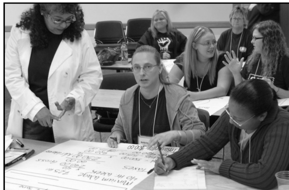
2012 Midwest School for Women Workers

A lot of info from folks who clearly know the subject and are able to answer questions on the spot.