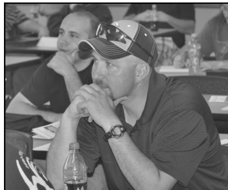
2012 Labor Short Course participants

Lodging options will be available either on site or at nearby hotels (lodging/meal costs are not included in registration fees unless specifically noted). English-Spanish interpretation is available for all programs with advance notice.