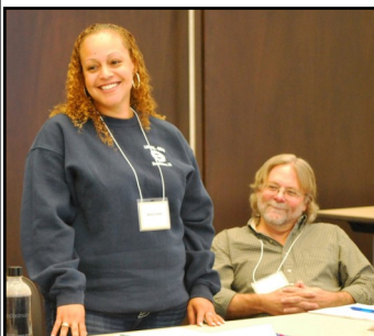
The Fall 2014 Union Communications course brought together labor writers and editors from across the state

Labor Center classes typically use highly interactive teaching methods designed to draw on the rich experiences of adult learners, especially in multi-union courses where leaders from various unions, sectors, and industries have the rare opportunity to spend time learning from each other and acquiring new skills to apply in their day to day work. As one course attendee put it, "I learned new ideas from the Labor Center and also from all the other students," while another praised a bargaining simulation exercise that "truly gave me a feel of what the process will be like."