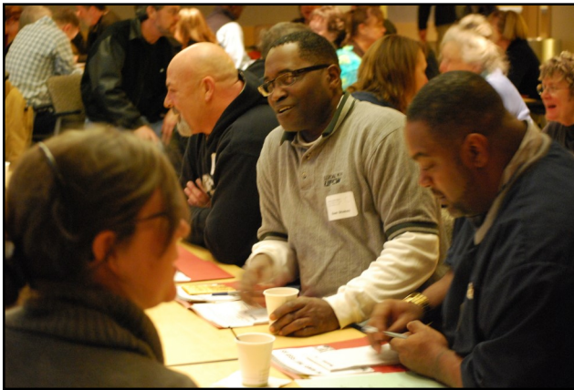
“Injustice on Our Plates” brought together Iowa food workers and UI students, scholars, and community members from faith, labor, and sustainable food organizations

Sponsored in conjunction with the UI’s Spring 2015 “Food for Thought” theme semester, the conference brought together scholars, workers, employers, students, and community members.