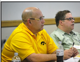
A series of Spring 2015 courses covered workplace laws including FMLA, OSHA, and Workers' Compensation