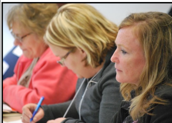
New leaders practiced investigation, writing, and presentation skills at a Fall 2014 New Steward School

2014-15 Labor Center education programs reached over 2,800 workers, including residents of 75 different Iowa counties.