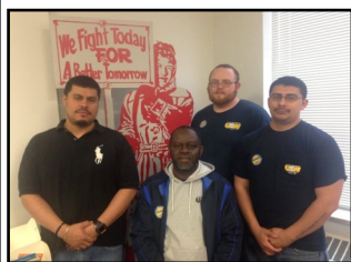
2016 Labor Short Course attendees explored Iowa labor history during a field trip to the Iowa Labor Collections in the State Historical Society of Iowa.