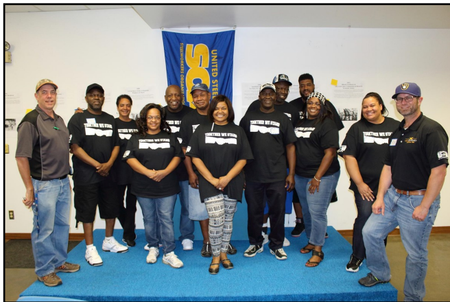
Several members of United Steelworkers Local 105 from ALCOA's Bettendorf Works attended the June, 2016, Quad Cities Black Workers' Conference.

planning is under way for another event in Des Moines.