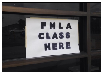
Off-campus classes reached over 1,900 workers during the year.

sector Iowa workers meet at least twice per year to review Labor Center course offerings and generate proposals for new projects, ensuring Labor Center programs remain responsive to the evolving needs and conditions of Iowa workers.