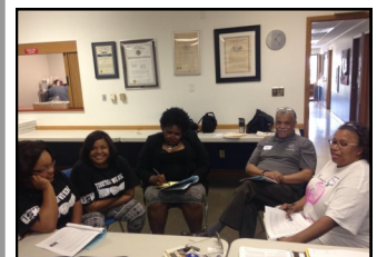
Quad Cities conference attendees examine roles of union civil rights committees.