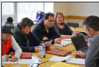
A dozen intensive on-campus courses drew 338 participants in 2015-16.

Engaging adult workers both on and off campus, 2015-16 Labor Center education programs involved 2,245 participants from 65 different Iowa counties.