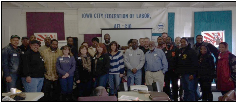
Over 40 attendees from dozens of eastern Iowa workplaces took part in Iowa City Federation of Labor's January, 2016, Black Workers' Conference.

I'm dying, every day. We all die. But the movement goes on. And how does it go on? New people. New education. New vision. That's how it goes on. You talk about what gives me satisfaction. That's what does. Finding those people. Getting them involved."