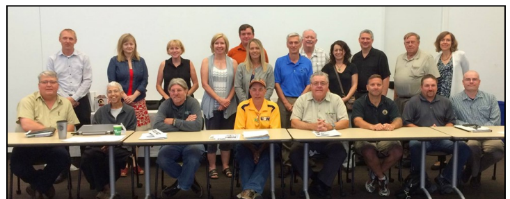
Members of the Labor Center's statewide Labor Advisory Committee met with Center staff in July, 2016.