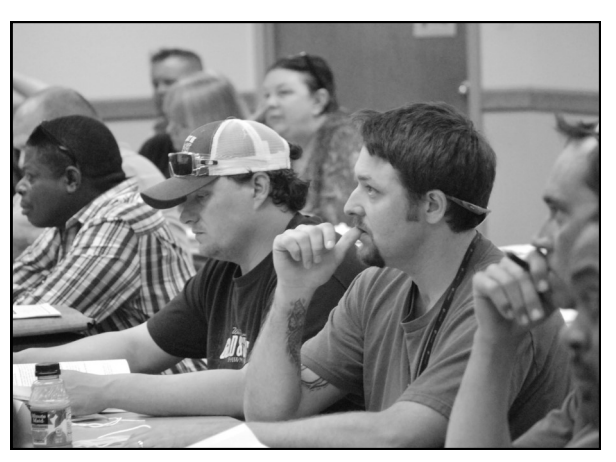
Labor Short Course participants

Great information! I've been a steward and union officer for over 26 years, and I still learned useful information.